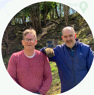
Volunteers from the Friends of Auchmountain have worked for many years on the restoration.