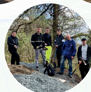
Trainees, employed by Inverclyde Trust, continue restoration work on The Glen